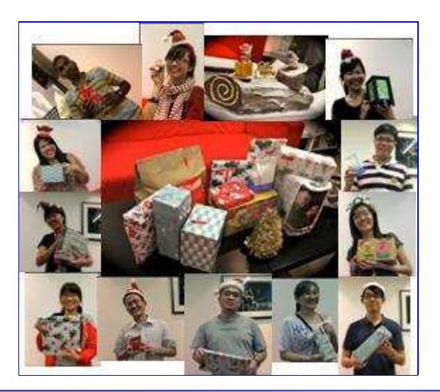
23 Dec 2011 Christmas gift exchange party at Pitchstop!